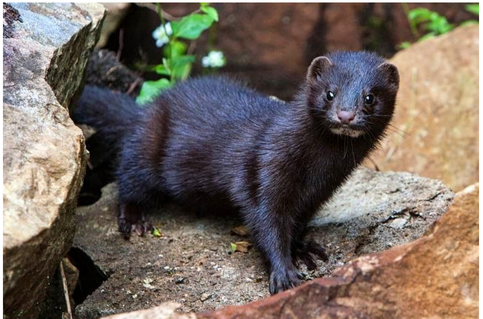
This photograph for illustrative purposes was not taken at Ogston.

We are therefore taking steps to participate in the effort so far as is practicable in the immediate area of our influence. If you should see the mink, which several members have recently, please make a note in the site diary. A photograph is always useful.