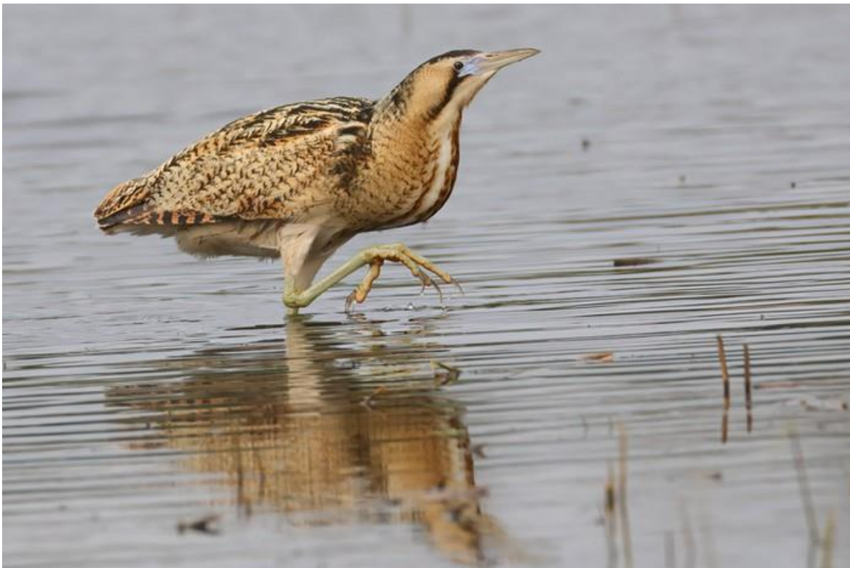
Bittern

A Rare Bird Alert article by Norfolk Wildlife Trust