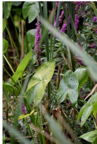
The plants are Marsh Woundwort Stachys palustris and Broadleaf Arrowhead Sagittaria latifolia with Purple Loosestrife behind.

In winding up the news highlights, here is a fine golden female Broad-bodied Chaser dragonfly photographed by Roy Frost.