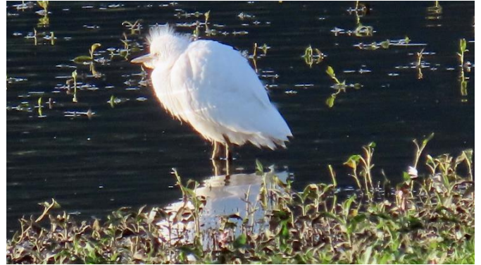
Cattle Egret

As I write this on 16 th August, a Spoonbill has today departed after 26 consecutive days.