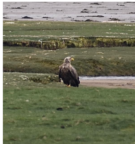
White-tailed Eagle beside Loch Gruinart

Digital: http://islaybirds.blogspot.com/2024/ with a link to joining the Whatsapp Group. Where to Watch Birds in Scotland APP – has useful up to date info.