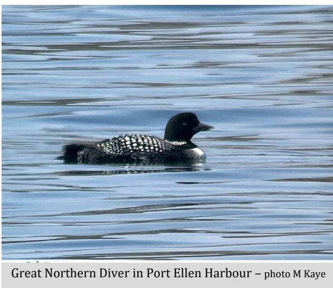
Great Northern Diver in Port Ellen Harbour

Check timings because you might need to arrange an overnight stay on the mainland before catching the ferry. In addition, it's important to book your accommodation well in advance – 12 months beforehand for a cottage is wise and register with Calmac for early warning of release of their summer sailings timetable.