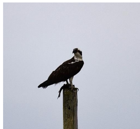
Osprey with fish near Loch Gorm