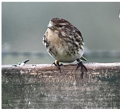
Twite in the RSPB car park on Mull of Oa

The Mull of Oa, the southern most tip of Islay, sports huge sea cliffs where it is likely that a resident pair of Golden Eagles nest. In addition, we've seen Whinchat, Twite and the usual moorland birds on the spectacular walk from the RSPB car park. The road to the Mull from Port Ellen deteriorates from tarmac to gravel part way along but is fine to drive along.