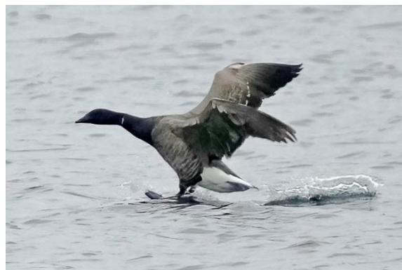
Photos of the Spoonbill, Grey Plover and Sanderling, and the Brent Goose